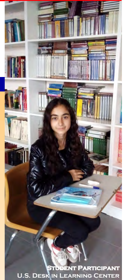
STUDENT PARTICIPANT U.S. DESK IN LEARNING CENTER