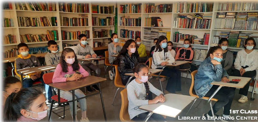
1ST CLASS LIBRARY & LEARNING CENTER

As we opened the doors to the new Learning Center in Lukashin, we were happy to see 15 to 20 students participate in each class. The class sizes continue to grow as we have been hosting English classes for youth three days a week. that are growing in popularity.