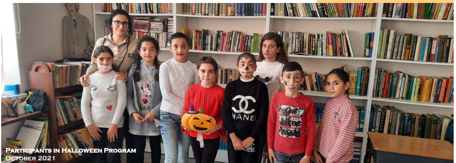
PARTICIPANTS IN HALLOWEEN PROGRAM OCTOBER 2021