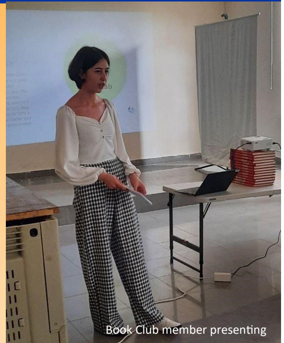
Book Club member presenting