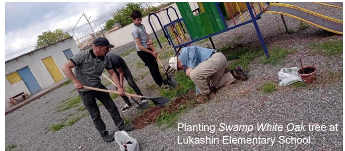
Planting Swamp White Oak tree at Lukashin Elementary School